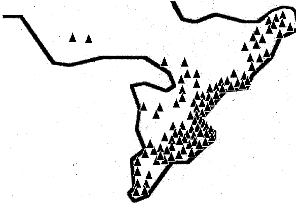
Figure 2. Areas with dogs with heartworm in 2010.

Ajax Alliston Amherstburg Ancaster Aurora Aylmer Barrie Beamsville Belleville Bowmanville Bracebridge Brampton Brantford Burlington Caledonia Cambridge Carleton Place Chatham Cobourg Cornwall Drumbo Dryden Dundas Dunnville